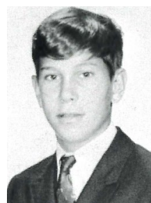
FRESHMAN YEAR '67 - '68