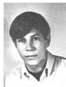
SOPHMORE YEAR '68 - '69