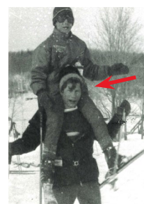
SENIOR YEAR '70 - '71