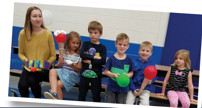
Pacelli High School Senior Service Day

Know someone who may not be an alum but continues to go above and beyond for Pacelli Catholic Schools? Nominate them for the Distinguished Service Award ! Deadline for nominations January 31, 2018.